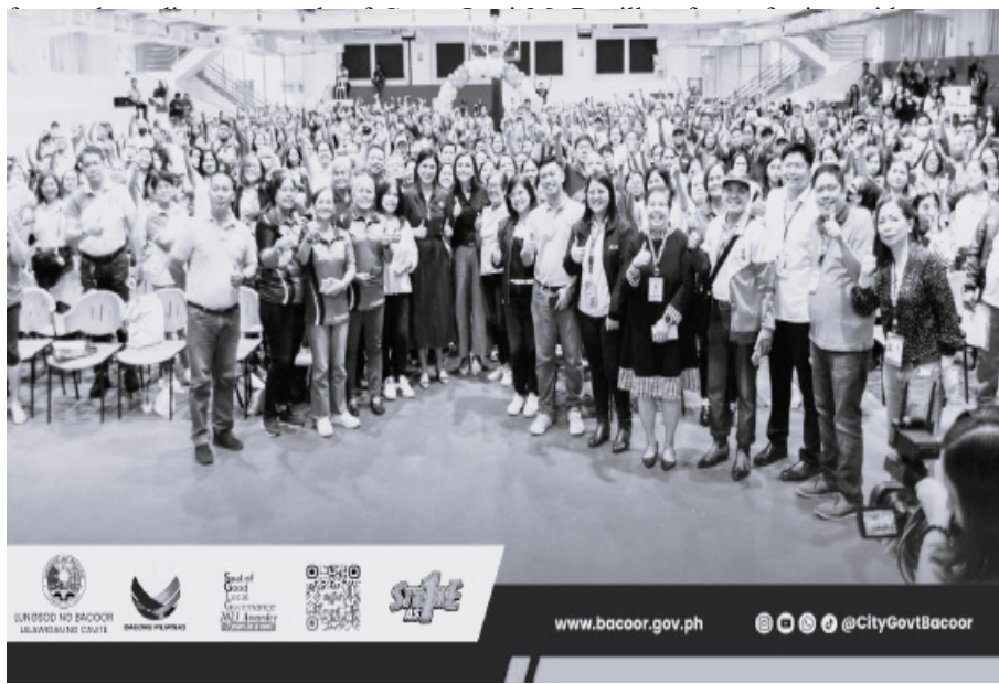
UNIFIED NO BACOOOR BARANGAYINONG KUNITA www.bacoor.gov.ph @CityGovBacoor